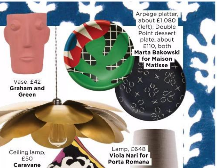
Vase, £42 Graham and Green