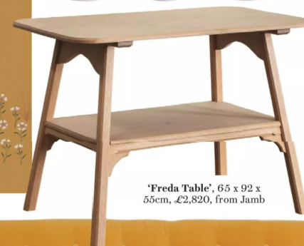
'Freda Table', 65 x 92 x 55cm, £2,820, from Jamb