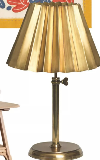
'Brass Pleated Shade', from £175; with 'Adjustable Brass Base', £350; both from Matilda Goad