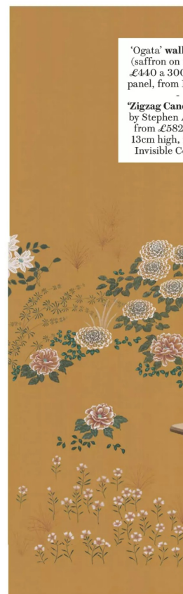
'Ogata' wallcovering (saffron on rayonne), £440 a 300 x 110cm panel, from Fromental