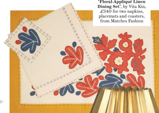
'Floral-Appliqué Linen Dining Set', by Vita Kin, £340 for two napkins, placemats and coasters, from Matches Fashion