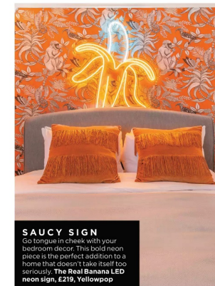
SAUCY SIGN Go tongue in cheek with your bedroom decor. This bold neon piece is the perfect addition to a home that doesn’t take itself too seriously. The Real Banana LED neon sign, £219, Yellowpop