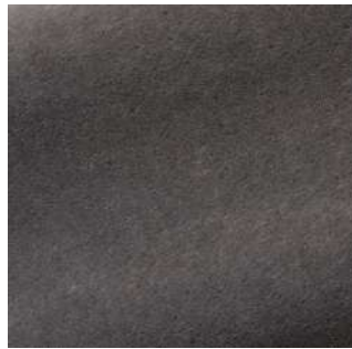
Éléphant - 019