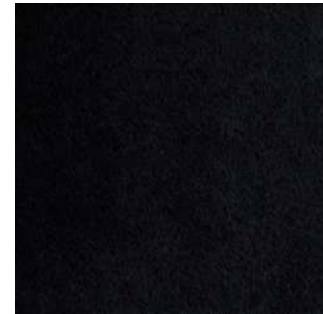
Noir - 008