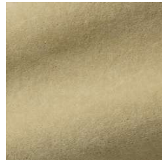
Graminées - 032