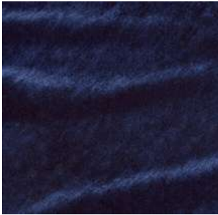
Marine - 009