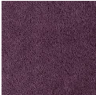
Amethyste - 010