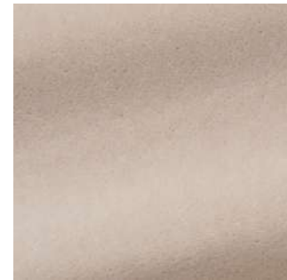
Nacre - 025