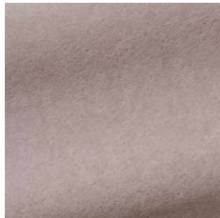
Plume - 023