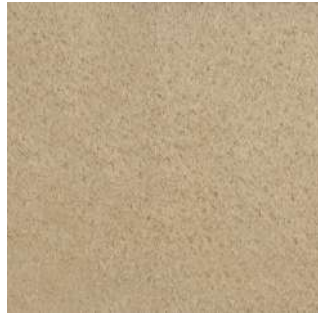
Crème - 002