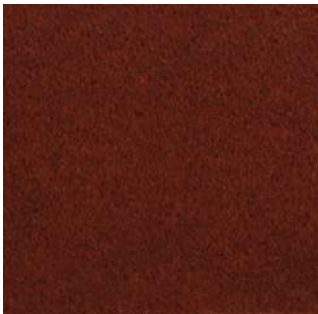
Acajou - 013