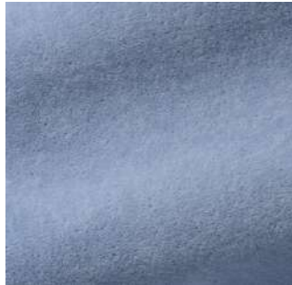
Ciel - 033