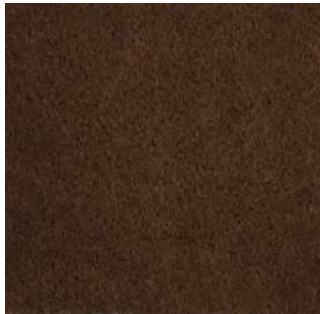
Moka - 005