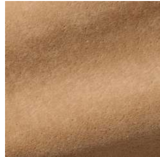
Bambi - 035