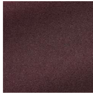
Aubergine - 020