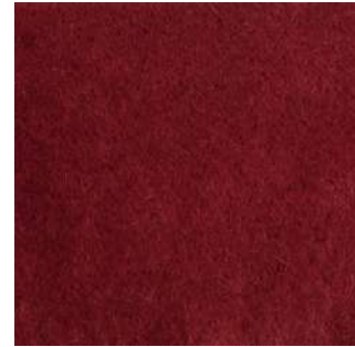
Cardinal - 012