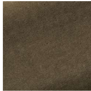
Hérisson - 028