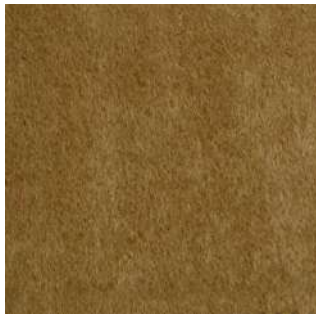
Moutarde - 015