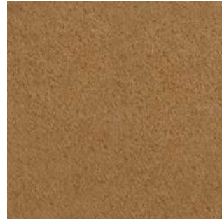
Miel - 003