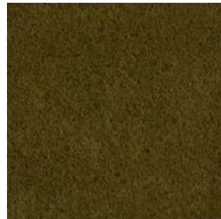
Olive - 016