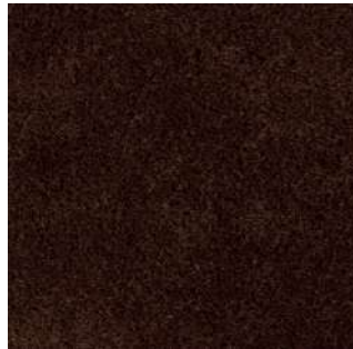
Café - 006