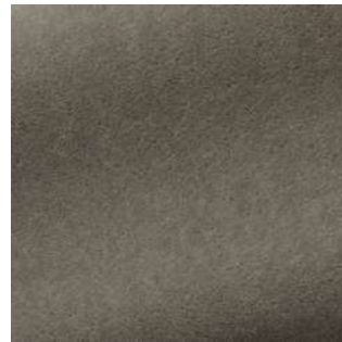
Écorce - 024