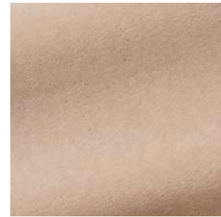
Dune - 029