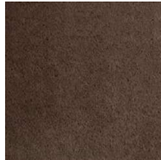
Gris Souris - 007