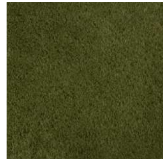
Mousse - 017