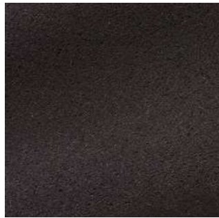
Choco - 027