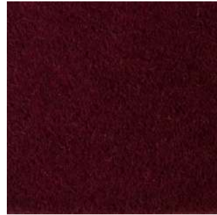
Bordeaux - 011