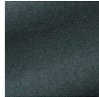
Cyclone - 021