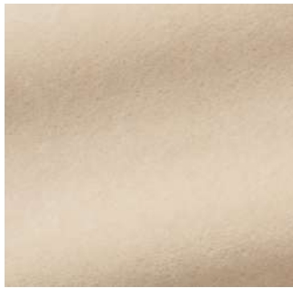
Sable - 026