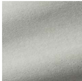
Perle - 031