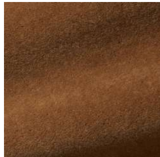
Caramel - 030