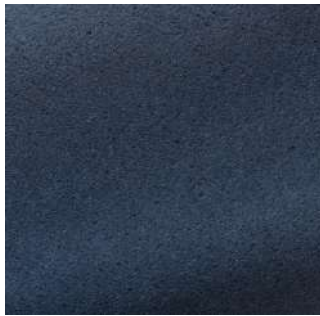
Orage - 018