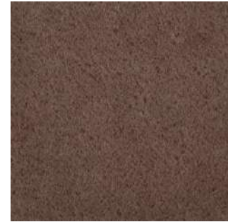
Taupe - 004