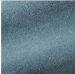
Céladon - 034