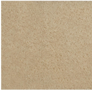
Crème - 002