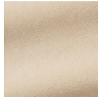
Sable - 026