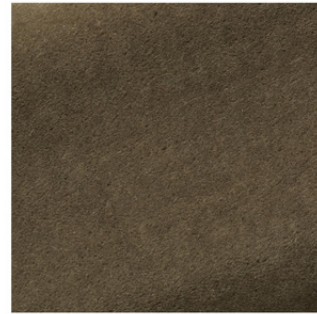
Hérisson - 028