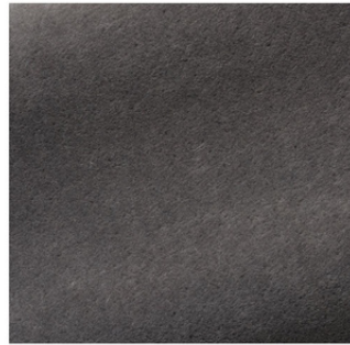
Éléphant - 019