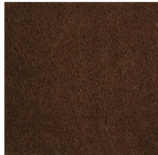
Moka - 005