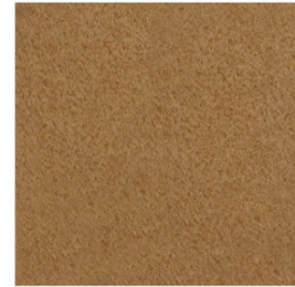
Miel - 003