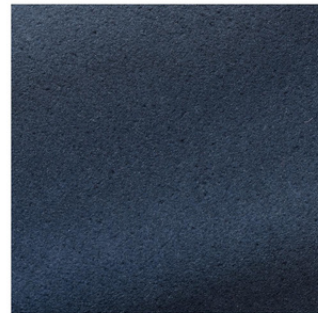
Orage - 018