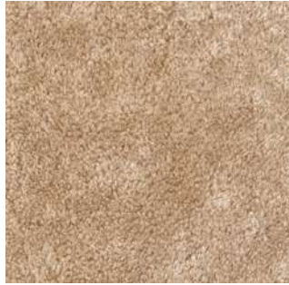
A Soft Place