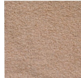
Laine et Chanvre, Rubelli (for cushions only)