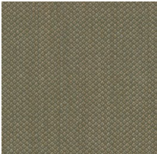
Fiord 2, Kvadrat