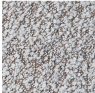
Copenhagen, Bisson Bruneel