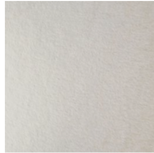
Yosemite, Manufacture Royale Bonvallet