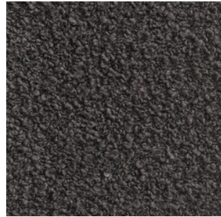
Testa Di Moro