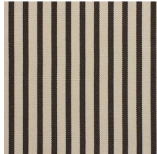
Armand Beige Black (outdoor)