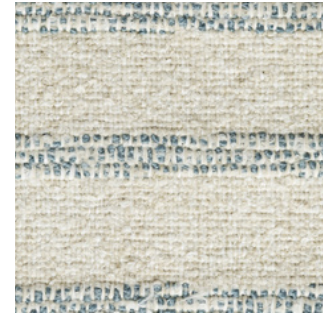
Marcel Blue Beige (outdoor)