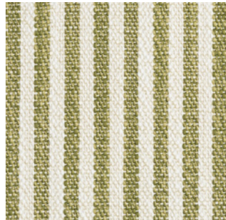
Raymond Green White (outdoor)