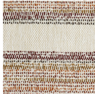
Diego Red White (outdoor)