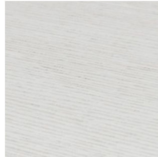
White Sanded Oak