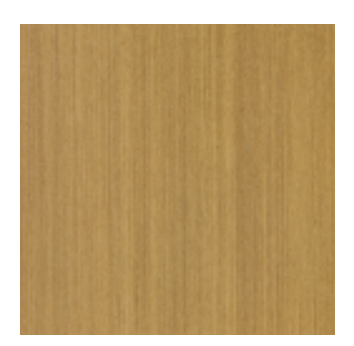
Patined bronze brass metal