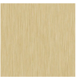
Brass brushed metal