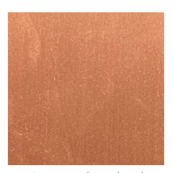
Copper brushed metal