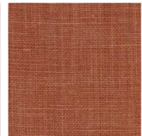
Terre de Sienne