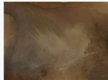
Jenna Bitar Siem, 2024 Mixed mediums, acrylic on canvas 69" x 49.5" $12,650