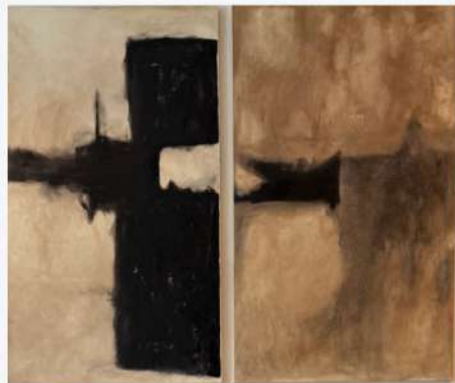
May Do 01 Seasons, 2025 Acrylic and plaster on canvas 36" x 60" in each diptych $32,200