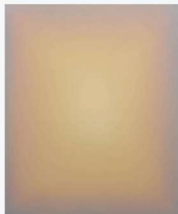
Eberhard Ross 14222 On the nature of daylight, 2022 Oil on hardboard (H) 23.62 (W) 19.69 inches $7,150