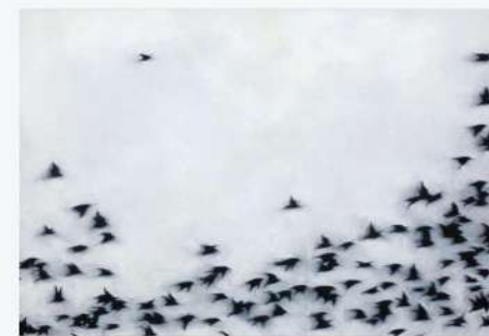
Eberhard Ross 13820 Flight, 2020 Oil on dibond (H) 23.62 (W) 35.43 inches $10,670