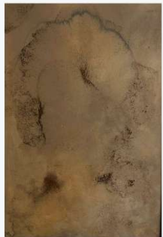
Jenna Bitar Atom, 2024 Mixed mediums, acrylic on canvas 63" x 43" $12,650