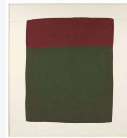
Ethan Caffisch Walking the Same Steps Again II, 2024 (Technique: Quilted linen and canvas, pine and brass brad frame) H 43.90 W 39.96 inches $9,350